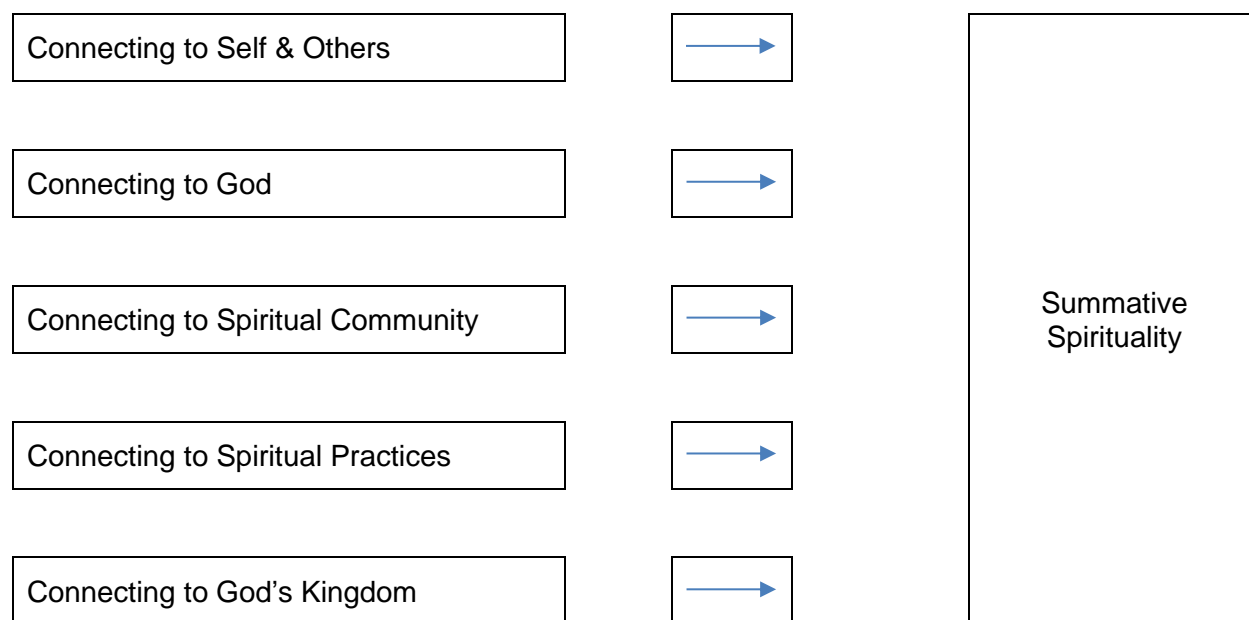
Figure 1. Spiritual Transformation Inventory domains mapped to summative spirituality. The figure compiles spirituality measures as an overall source of spiritual magnitude.

individuals in organizing and summarizing personal spiritual development information (Hall, 2015). Hall's (2018) five spiritual domains include connecting to self and others, connecting to God, connecting to spiritual community, connecting to spiritual practice, and connecting to God's kingdom. A holistic view is provided using The Connected Life STI 2.0 (see Figure 1).